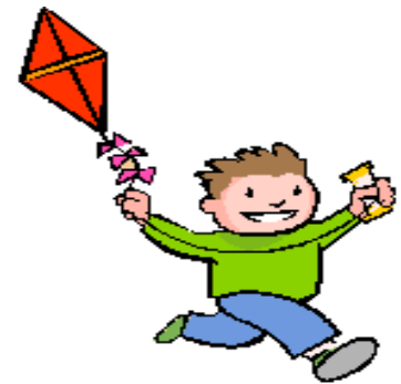
Fly a Kite