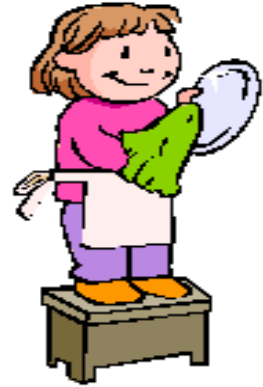
Dry Dishes INSIDE the House