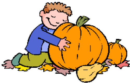
Pick a Pumpkin