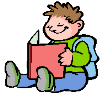
Read a Book INSIDE the House