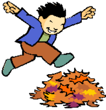
Jump in a Pile of Leaves

Directions: Fall comes before winter. It starts to get colder, leaves fall from trees, and we celebrate Halloween. Circle the activities you can do in fall OUTSIDE.