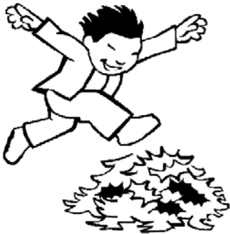
Jump in a Pile of Leaves