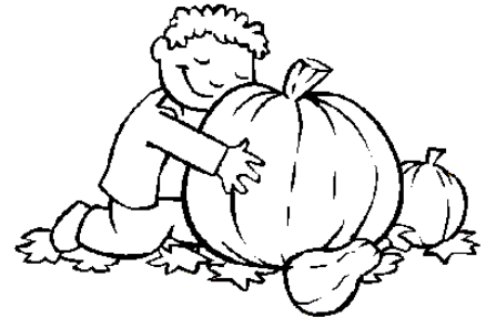
Pick a Pumpkin