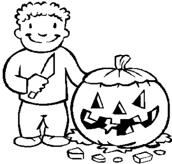
Carve a Pumpkin

Directions: Fall comes before winter. It starts to get colder, leaves fall from trees, and we celebrate Halloween. Circle the activities you can do in fall. Color too!