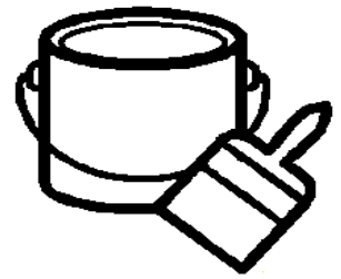
Paint Brush & Can