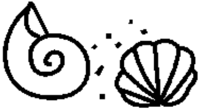
Sea Shells & Sand

This is a lifeguard. He helps keep us safe at the beach. What things are you likely to see at the beach? Circle the pictures and color them all!